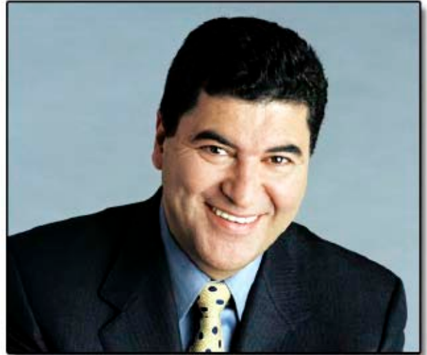
Elias Zerhouni, NIH Director

Click on http://www.niehs.nih.gov/od/council/video/home.htm to view the videocast of Zerhouni's presentation.